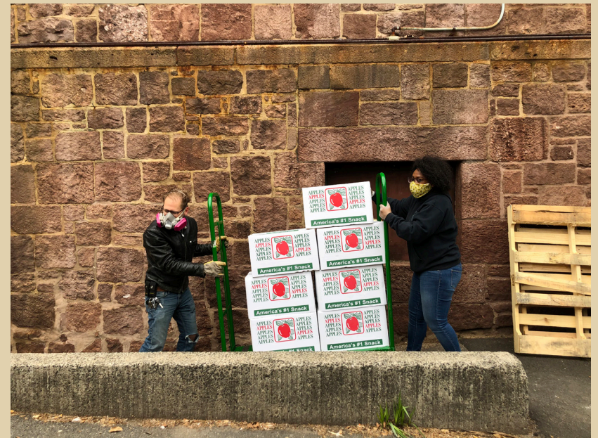
Response team volunteers delivering food prepared in bundles to seniors and those considered "at-risk" throughout several of our communities.

God has used this unexpected time to produce unprecedented health in our church ministries!