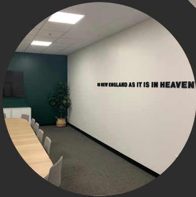
VOX CENTRAL OFFICES